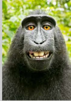
Above: Posing to take its own photograph, unworried by its own reflection, even smiling. Surely a sign of self-awareness?